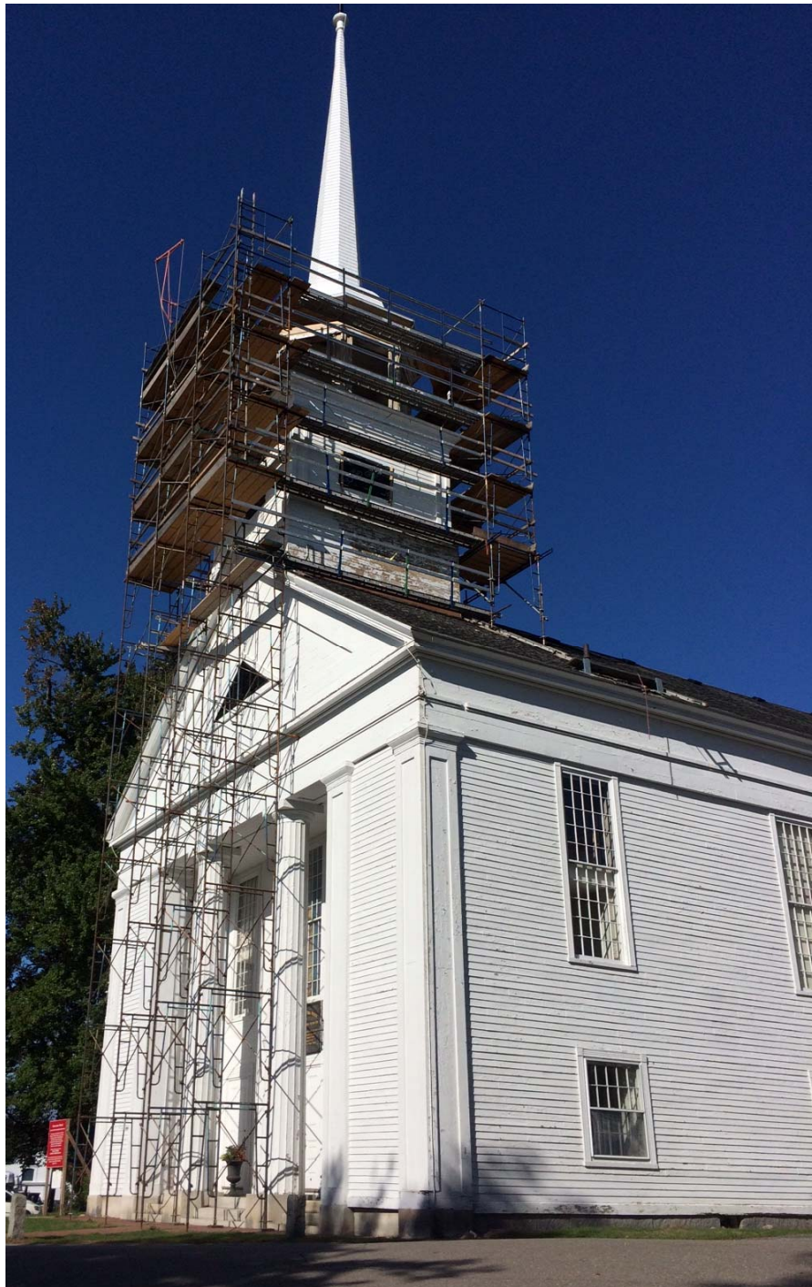
Figure 7: First Parish Restoration

The historic First Parish Church (see Figure 1 ), built in 1755 and Groton's oldest continually functioning public building, is undergoing major restoration and structural repairs. These include complete exterior repainting, restoration of the dome (using copper) and the spire that houses a Paul Revere & Company bell. The property is owned by the Town of Groton. The First Parish request for $203,333 was approved at the 2015 spring Town Meeting. Additional funding is being provided privately.