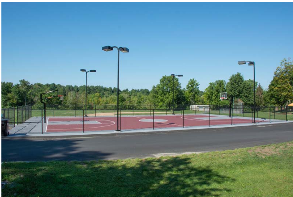
Figure 8: Town Field Basketball Court

Figure 8 ), underwent full-scale restoration. The town field restoration included lights that allow for evening play. The Parks Commission request for $109,000 was approved at the 2016 spring Town Meeting. The DPW provided the majority of labor and materials for the projects.