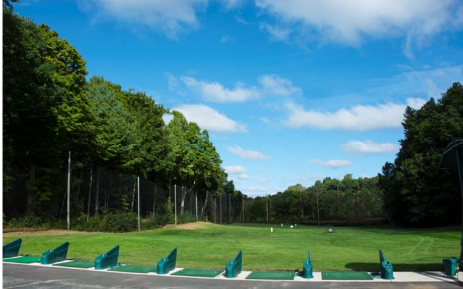
Figure 5: Country Club Driving Range Improvements

The Groton Country Club driving range (see Figure 1 ) benefits from major improvements including new poles and netting that allow any use of any club, new range mats, and a new range picking machine for improved ball retrieval. The Country Club request for $47,000 was approved at the 2015 spring Town Meeting.