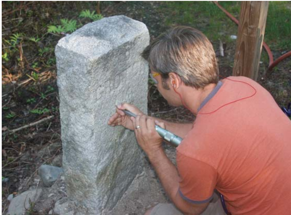
Figure 9: Milestone Restoration